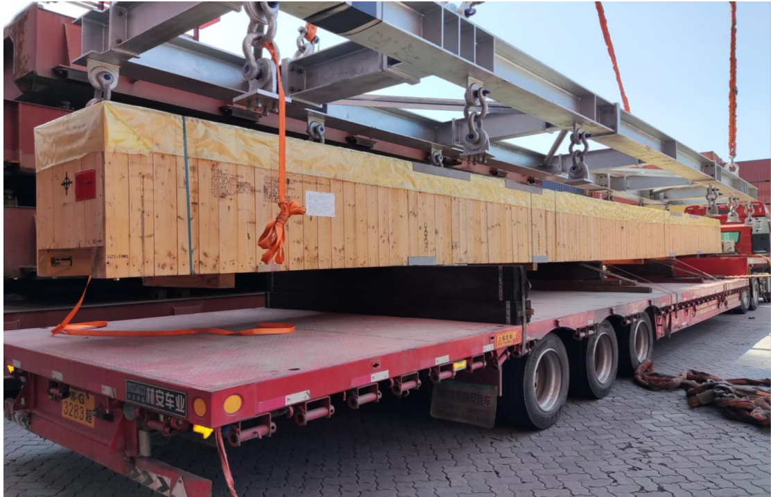
Deliver BBK at CNEE's premier via road transportation: